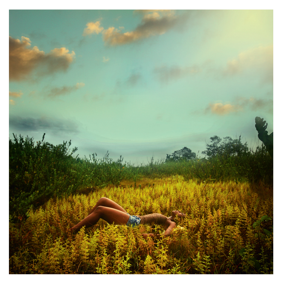
Chrysalis. Archival pigment print. 48 × 48 in. ©2013 Khadija Benn (b. Canada 1986; works in Guyana). Image courtesy of the artist.

man shielded behind a mask of tiny white dots—eyes visible, face brilliantly illuminated.