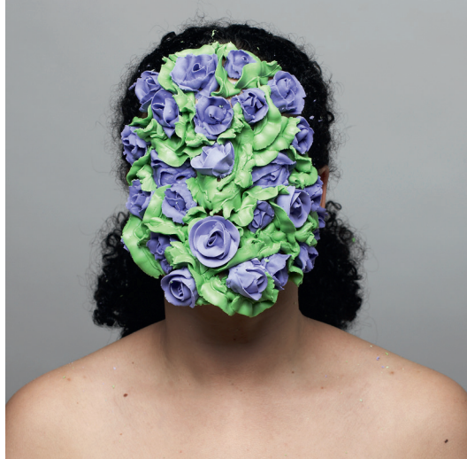
The Impossible Speech Act . Digital photograph. 40 × 40 in. ©2007 Erika DeFreitas (b. Canada 1981). Image courtesy of the artist and Canada Council for the Arts, Art Bank.

reconnect, to reclaim homeland. "I am distant and removed," the artist says. "The paintings are a contemplation of space... a forgotten space."