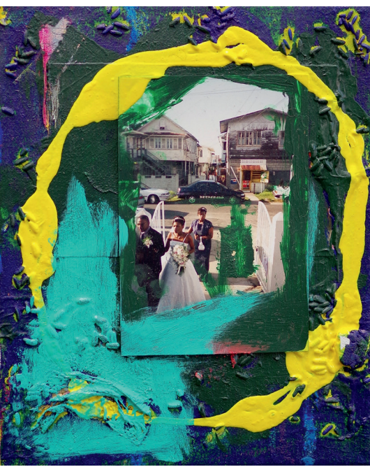
(Left) My Dreams Talk About A Place from the series, Pieces of Land, From Where I Have Come. Mixed media, painting, and photography on canvas. 8 × 10 in. ©2016 Kwesi Abbensetts (b. Guyana 1976; works in United States).