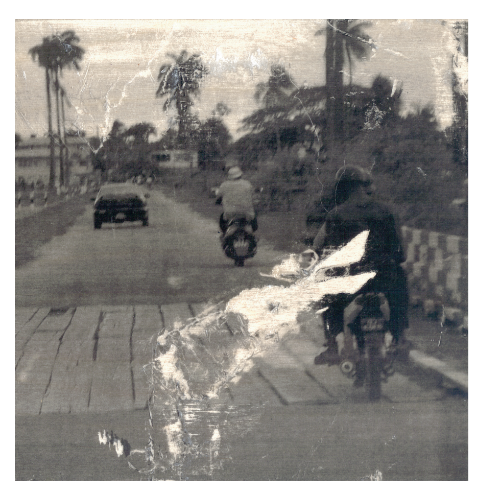
from the installation Place in Reflection. Photo gel transfer on wood. 8 × 6 in. ©2016 Sandra Brewster (b. Canada 1973).

"The masks did not become a substitute object in each of our images," says DeFreitas, "they melted from the heat emitted from our bodies, the flowers and leaves eroding, sliding slowly down our faces . . . a reminder of the persistence of impermanence." The viewer is left with the notion